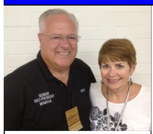
On Sept. 25th we had our Annual Western Motor Home Association Meeting in Hanford, CA and it was well attended. I thank all the National Directors, Chap-

ter Presidents or VP's, and Indio Captains who attended. Those of you that did not attend I hope you will make this meeting a priority to attend next year. The 2012 - 2013 budget was passed as presented after a line by line discussion. We then had time for Regional Workshops. After lunch the afternoon was spent planning our Indio Western Area Rally. Changes for 2013 are that we are moving Will Call & on Site Registration to the Holding Area. Electric will now be included on the Rally Registration. Chapter Party Areas will be charged for by the number of electric plugs they use, the charge is $60 each. Each Captain presented his needs for supplies, golf carts, & misc. All volunteers will have electric when they come