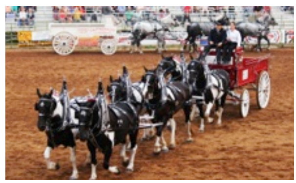
Beautiful horses on parade