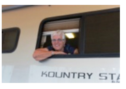
Sandy's order window