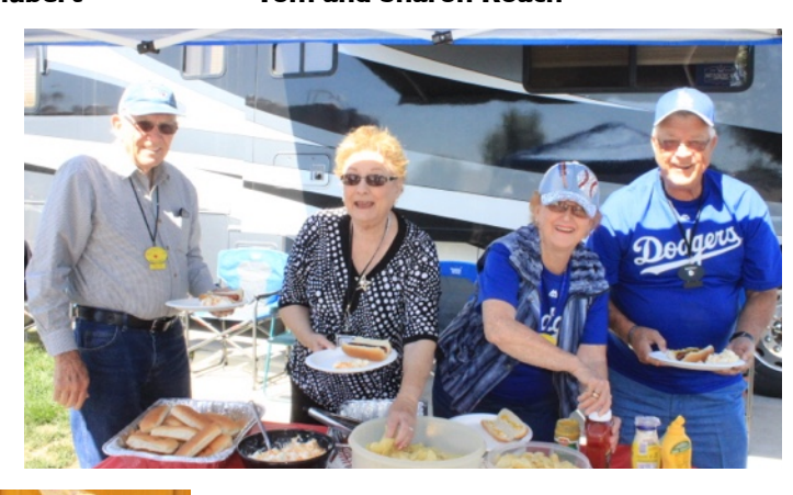
We always find time to eat!!