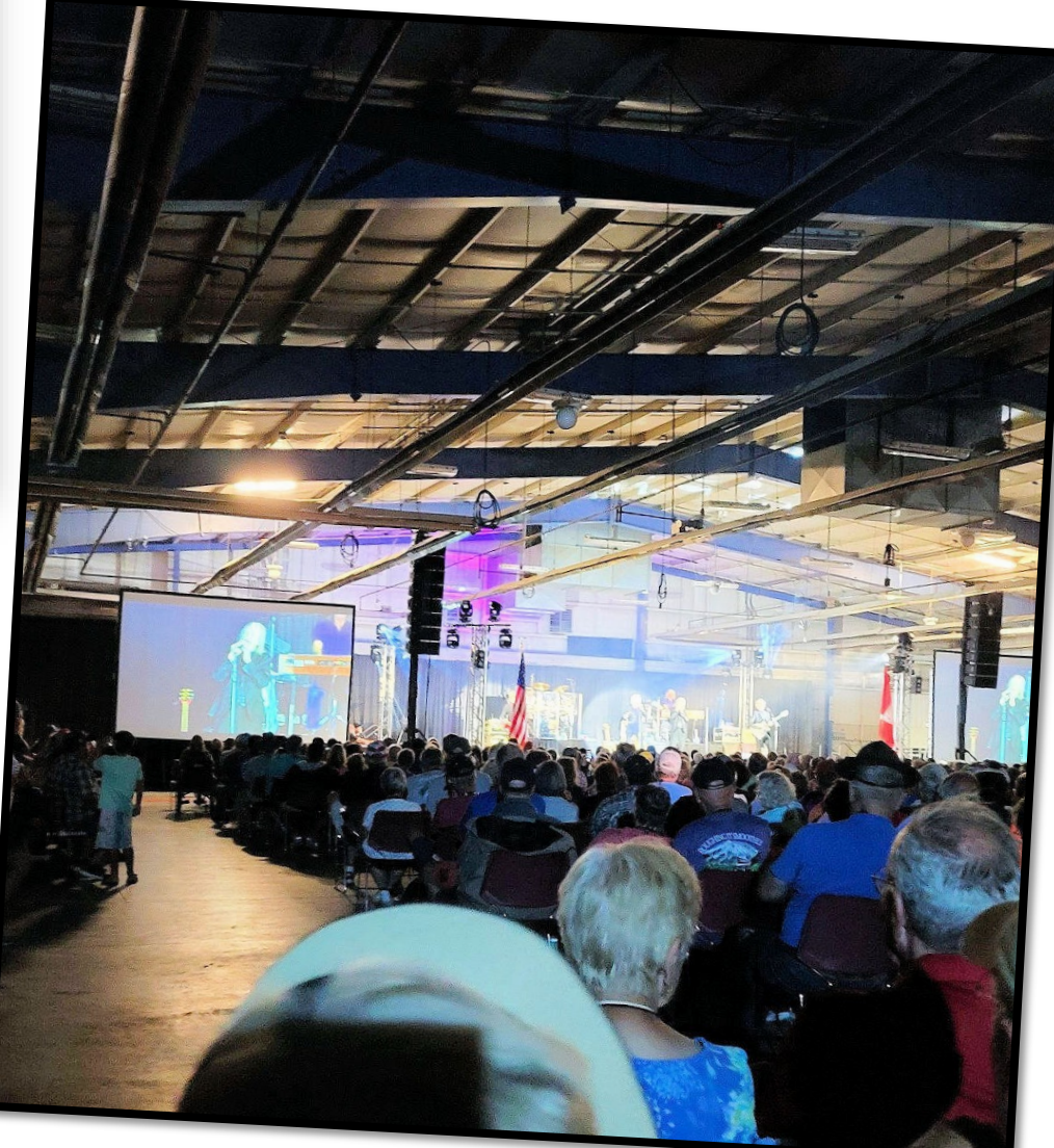
Saturday night entertainment at FMCA Convention, Gillette, Wy