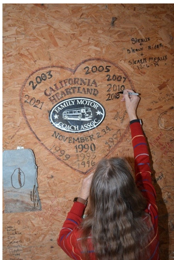
Melanie dresses up our graffiti