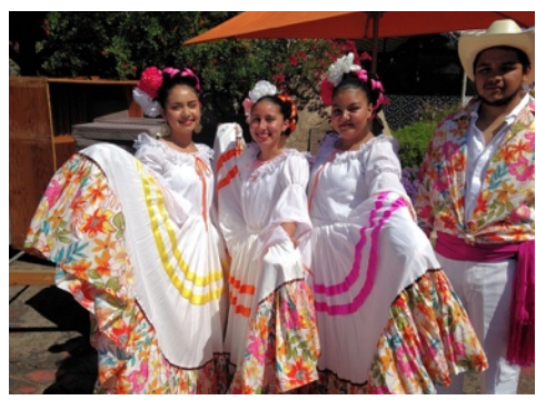
Beautiful girls and great music