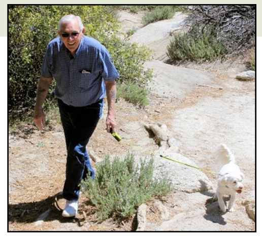
Wade and Jet out for a walk.