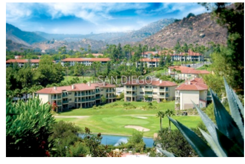
San Diego, CA