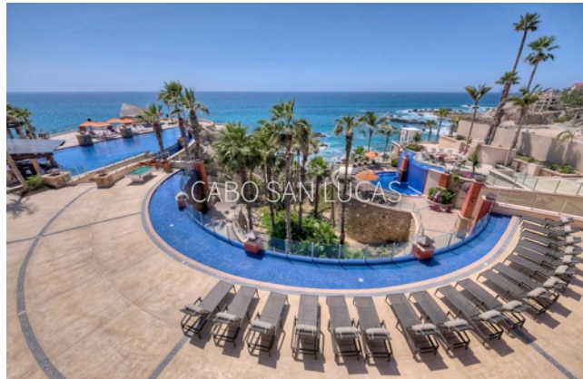
Class A resort locations