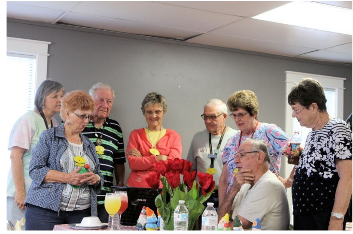
How do I get plugged in?