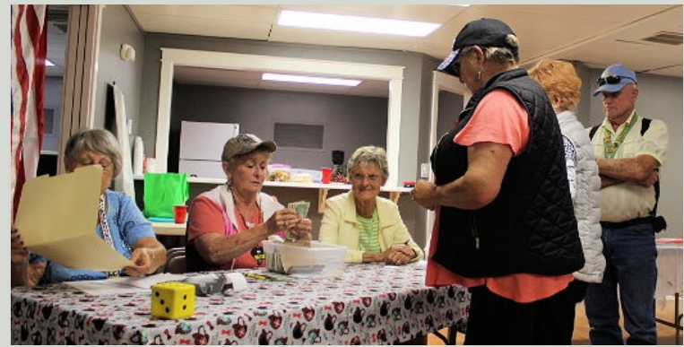
The "Bookies" for the horse race