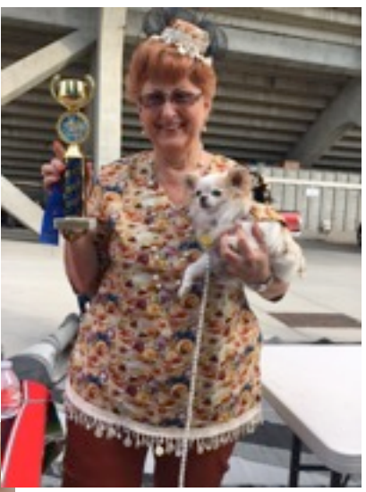
First place Theme Team. The dog and owner were dressed to match the theme. They both had red hair.