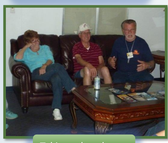
Taking a break