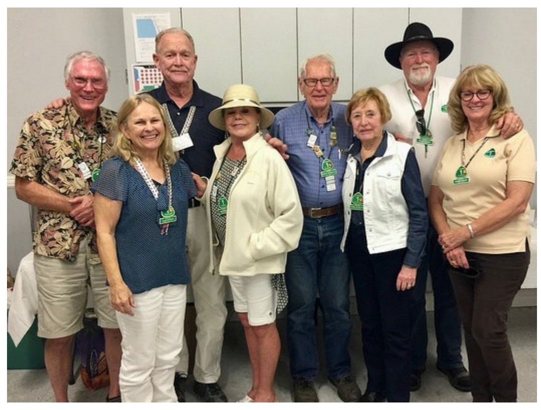
Pismo Beach Rally Committee

Everybody seemed to have a great time. The fun and fellowshipping is always great when the Coasters get together.