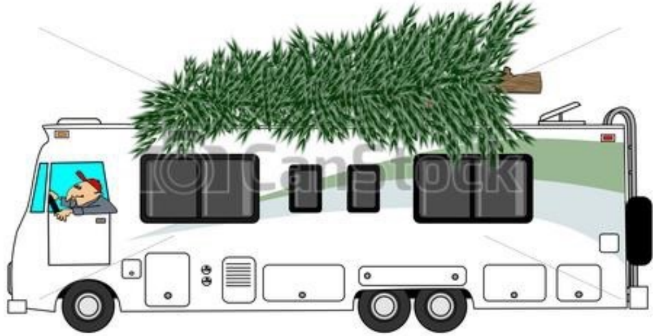
© Can Stock Photo - csp17201988