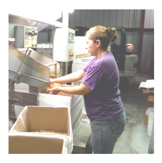
with a pound of shelled, packaged nuts!

grocery stores. Some nuts are just in pieces and these are sold to bakeries, etc. for cooking. Some of the nuts are left in the shell and put in big bags to be shipped to different countries. Women on the conveyer belts sort the bad nuts from the good. It takes many different machines that are all going at once to sort, pack, and box the nuts. David told us he processed about 10 million pounds of walnuts this year. We all went home