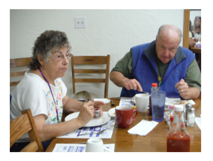
machine, etc. Then we went to his