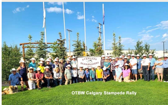
OTBW Calgary Stampede Rally