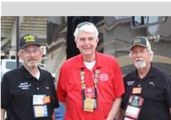
WMHA Senior Vice President, Past President & President