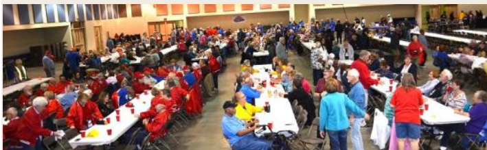
The volunteer appreciation dinner

We especially need help with setting up tables and chairs. If you and/or your Chapter are interested and would like to volunteer, please contact Carole Hazeltine (see info below).