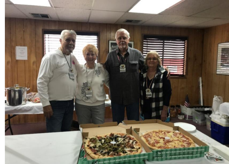
Games tonight were BUS NUT BINGO AND TENZI! Fun time but no fotos!