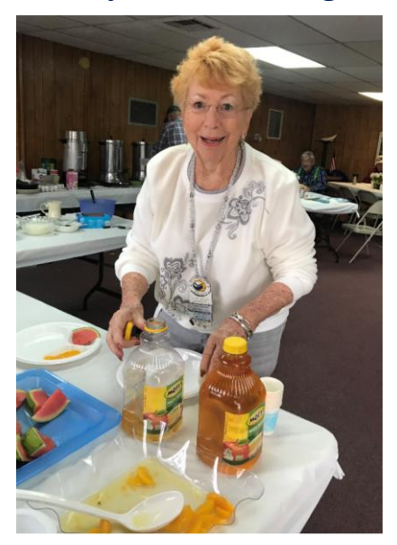
Getting our instructions, our pot watchers and one of our preparers.