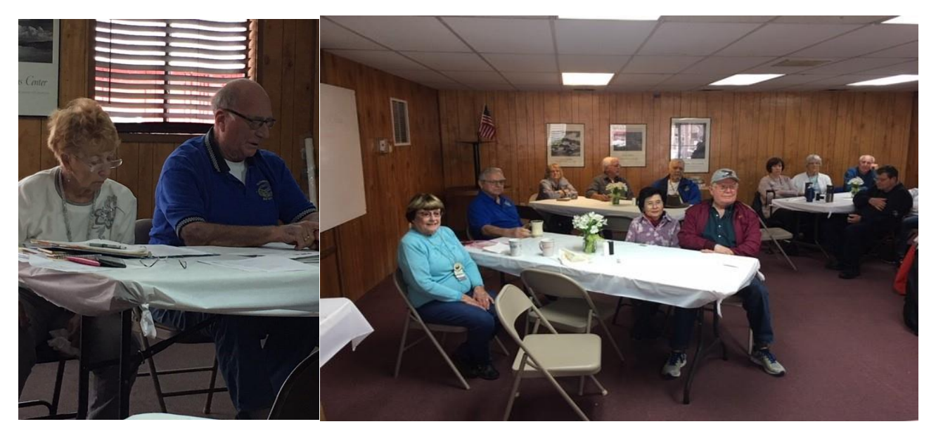
IMPRESSIVE!!! EVERYONE PAYING ATTENTION AND AT LEAST ONE TABLE HYDRATING!