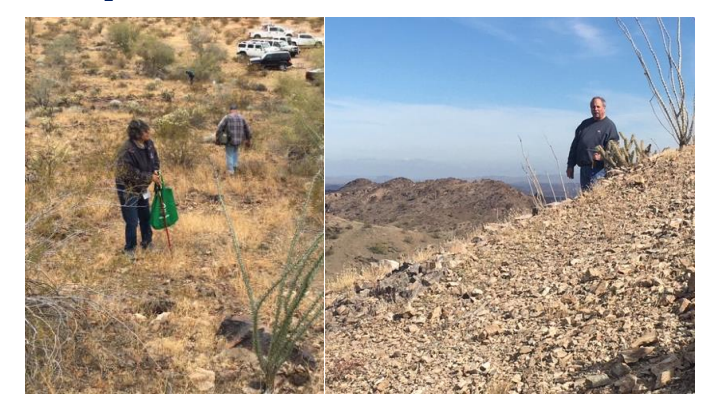
First Edda had to shop! New walking stick! Jim got new shades...sporty, polarized, scratch resistant, and night driving sun glasses with side viewing lense! WOWZER! Now they were in search of the perfect rock! A Brenda Red Jasper Agate!!