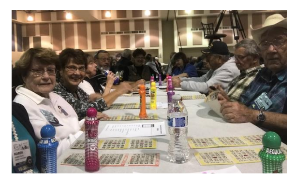
Must not forget Bingo!!