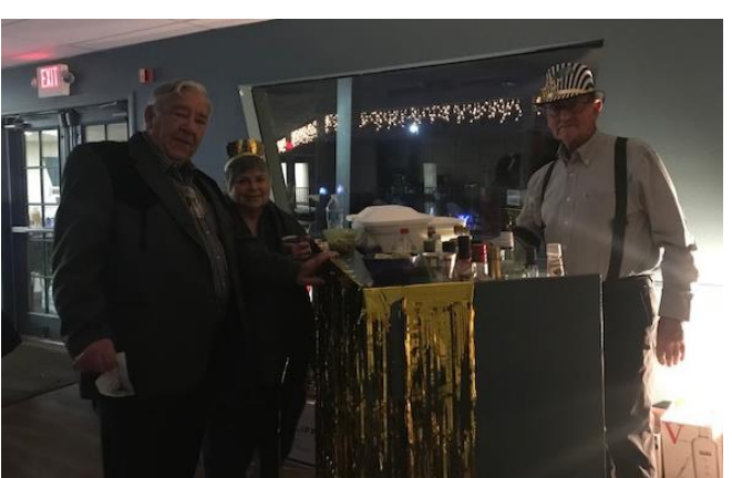
Getting ready for our big celebratory dinner!