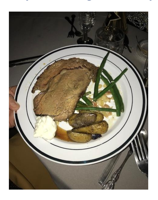
...Thin cut Prime Rib, tates, and 5 at most green beans!!! I must say the flavor was delicious, but.....