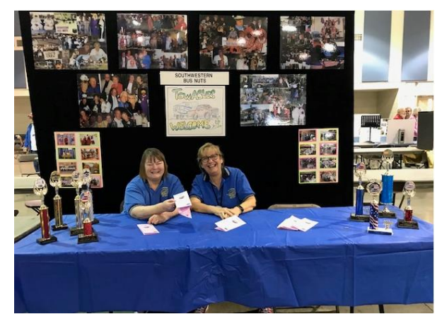
Moving on...New Member Booth