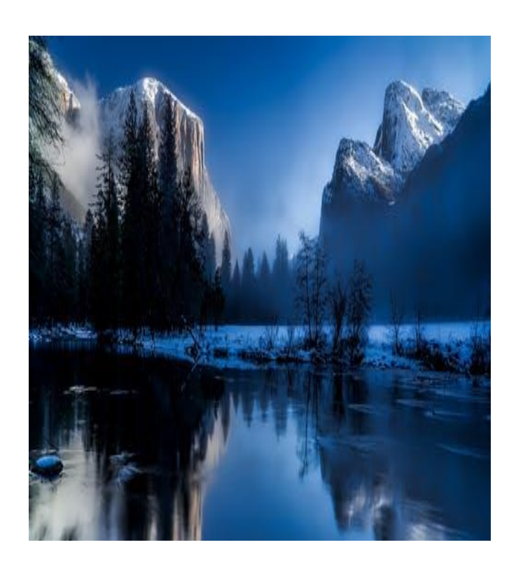
Enjoy the beauty of winter but stay safe and warm also!