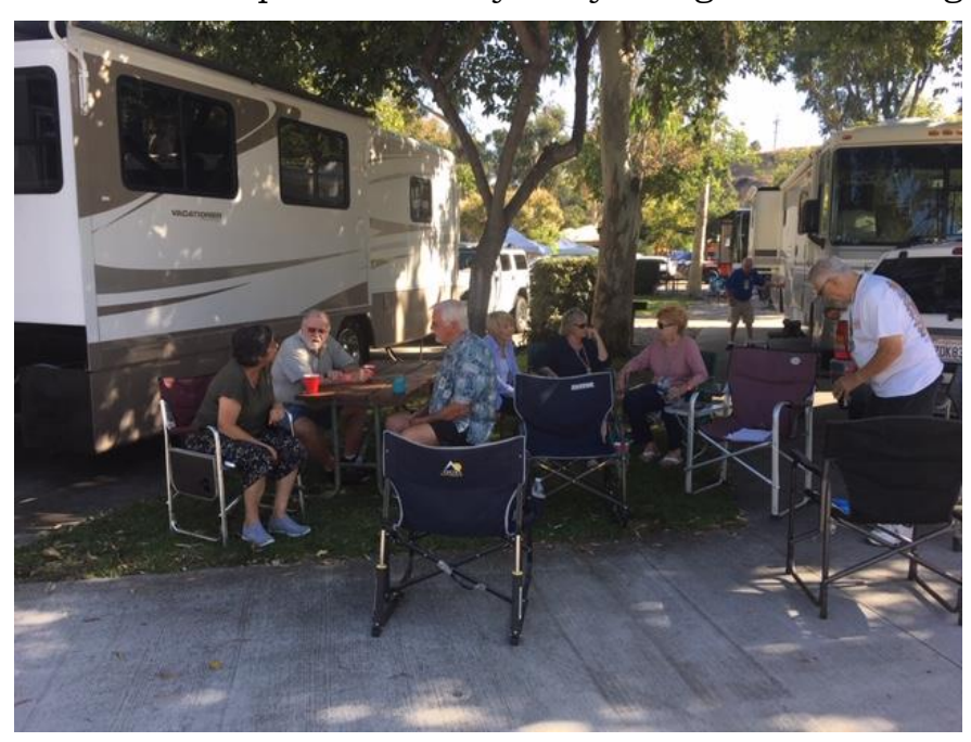
...AND THE BUS NUTS SOLVING THE WORLD'S PROBLEMS...GOOD LUCK!!! IT'S GONNA TAKE MORE THAN THESE NUTS!!!

We all kind of passed the day away doing our own thing.