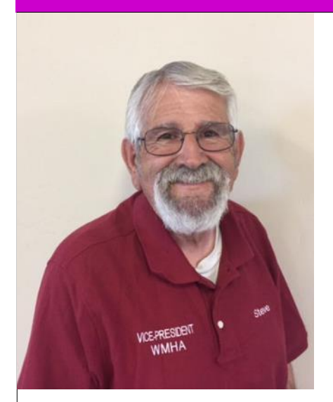
Hi to All.

I have been going through a few medical issues, and I am happy to say that all is well now.