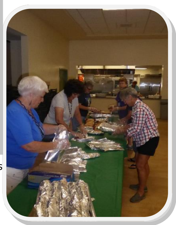
Wrapping Hot Dogs