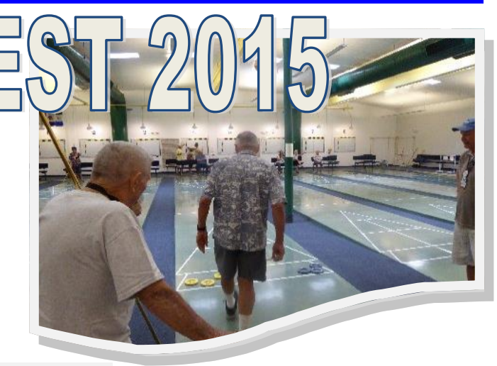
Shuffle Board Tournament