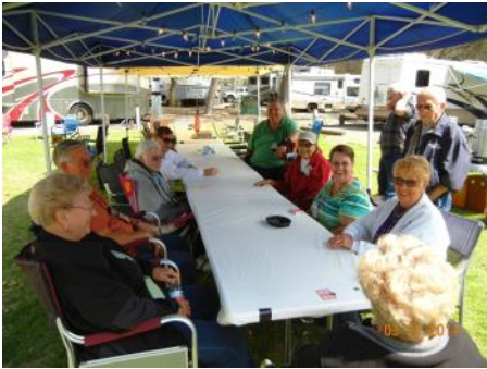
on going Paducah game