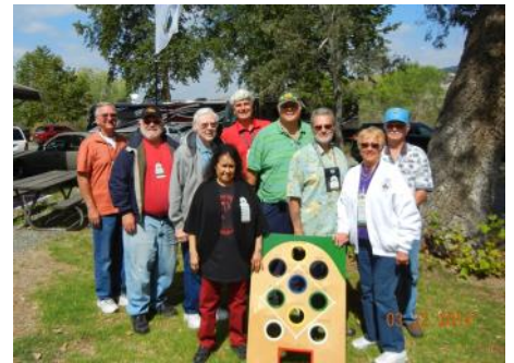
2nd game winners