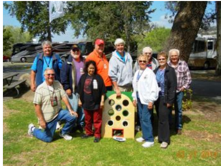
1st game winners