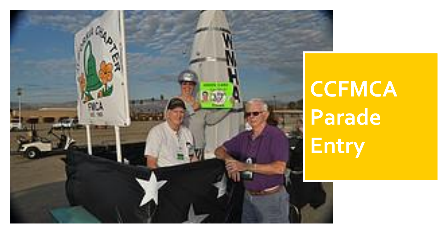
Jan/Feb 2015 CCFMCA Page 6

Final selection of pictures will be the sole decision of the Trailboss In case of a tie the winner will be decided by the highest card dealt to those involved